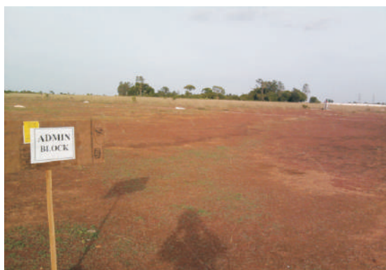
The Medical College and Admin Site (2009)