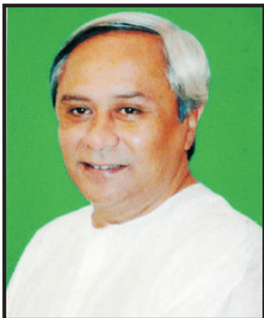
NAVEEN PATNAIK CHIEF MINISTER, ODISHA