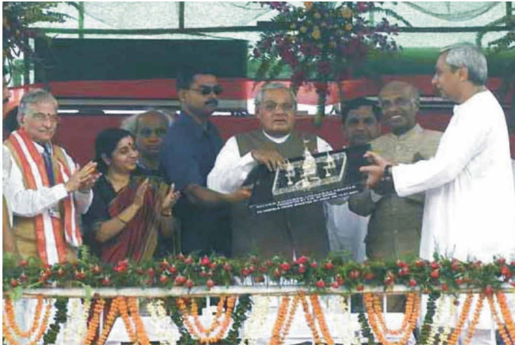
Shri Atal Bihari Vajpayee the then Prime Minister, laid the foundation stone of AIIMS, Bhubaneswar on 15 th July 2003