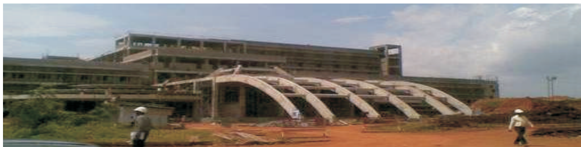
The Hospital in progress (2012)