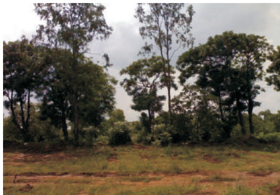
Trees at Hospital Site(2009)