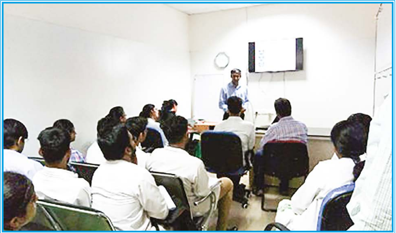
Fig 2: Academic Activities at Dept. of Radiology