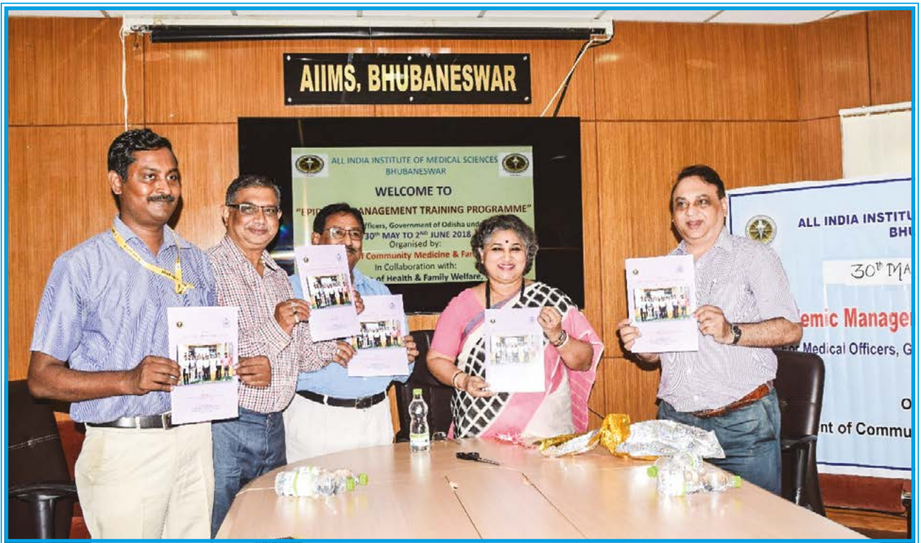
Report release of Epidemic Management Training Program for new Medical Officers of Odisha Public service Commission