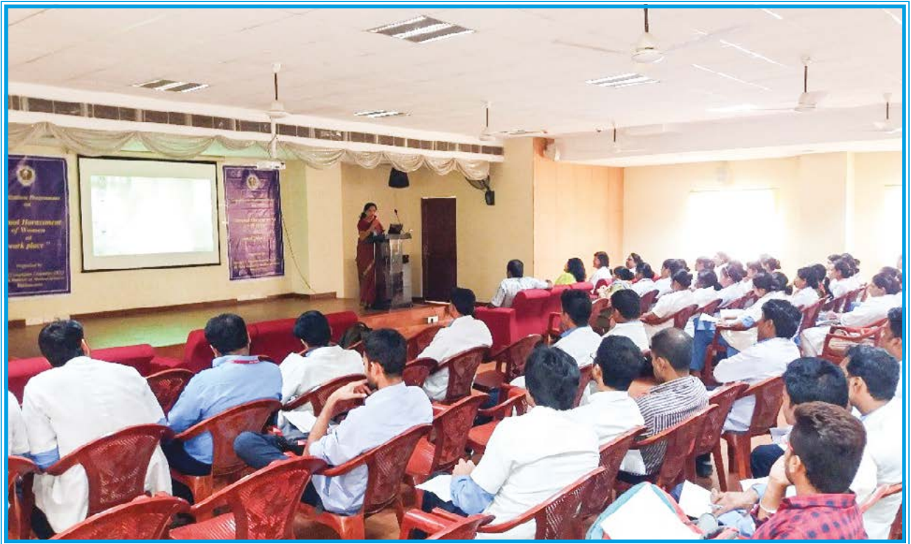
Picture showing The third session of the sensitization Program