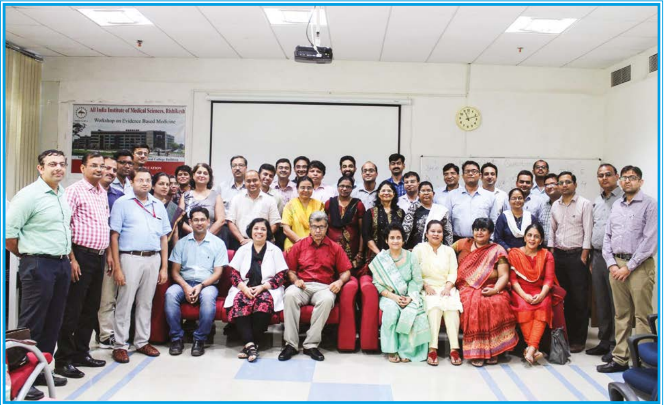
“How to practice Evidence Based Medicine Child Health” at AIIMS, Rishikesh from 15th - 16th September 2017.