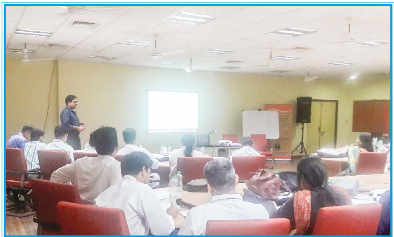
Faculty Development Program organized by Medical Education Unit in collaboration with NTTC JIPMER