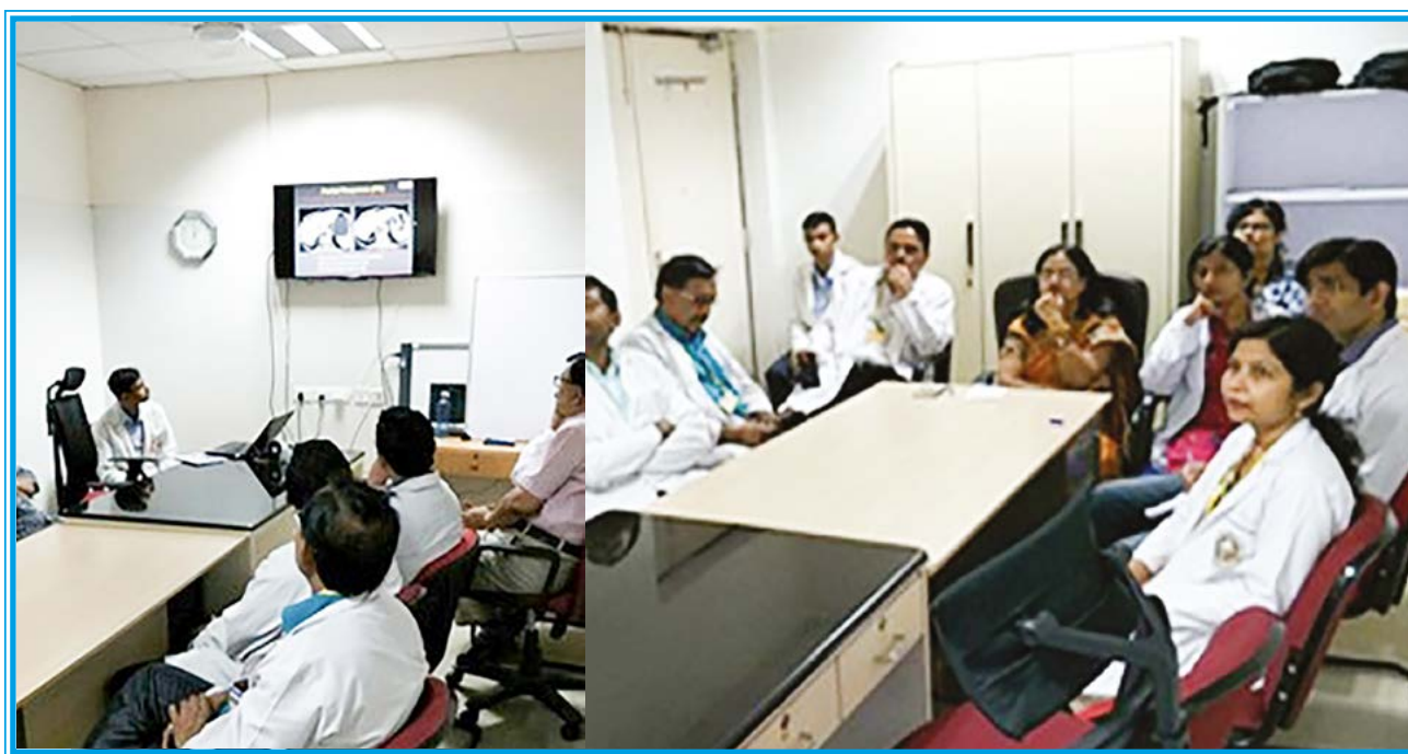
Fig 1: Academic Activities at Dept. of Radiology