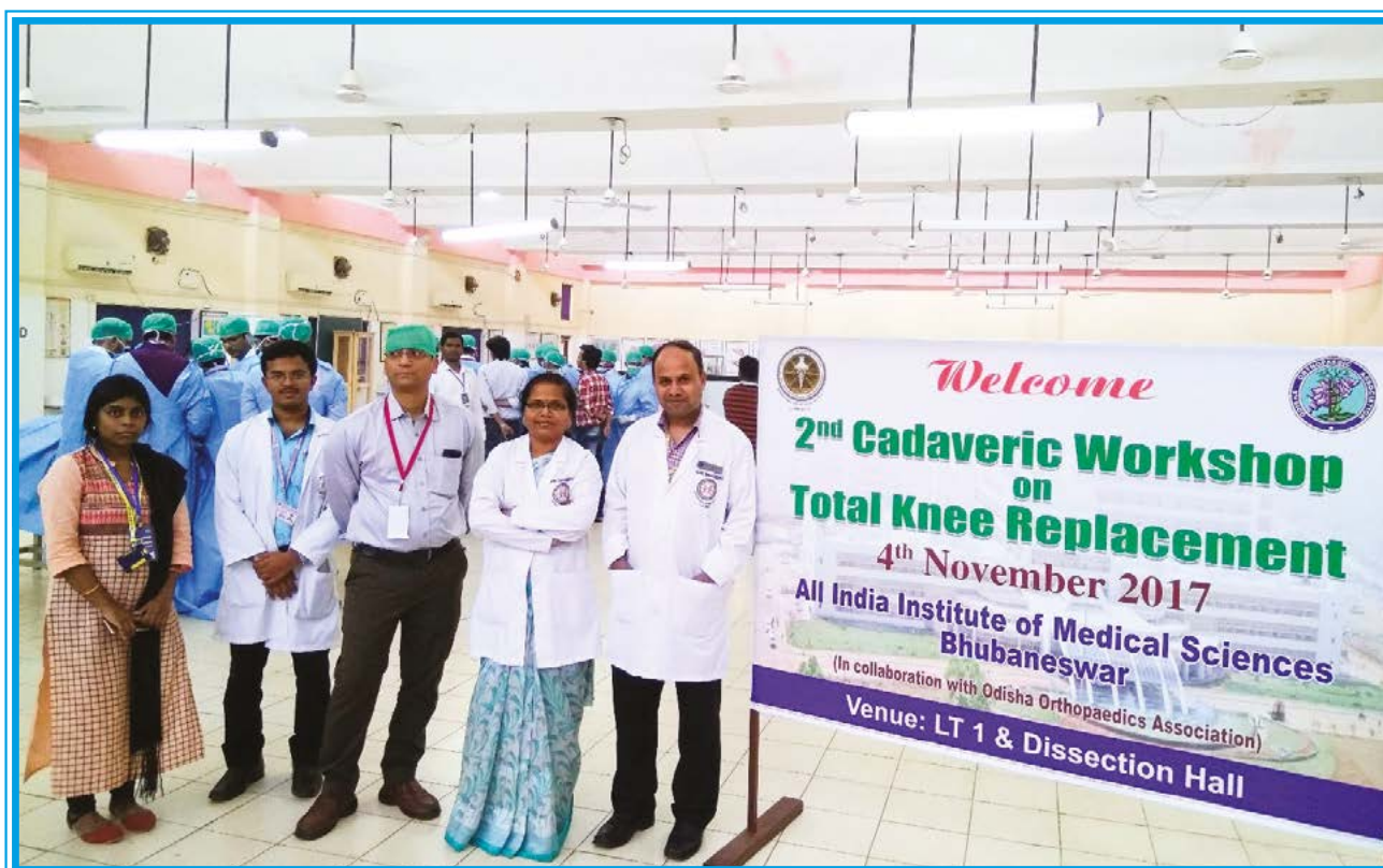
Fig 1: A Cadaveric Workshop on “TOTAL KNEE REPLACEMENT” was organised on 4th Nov 2017, in association with the Dept. of Orthopaedics, AIIMS, Bhubaneswar.