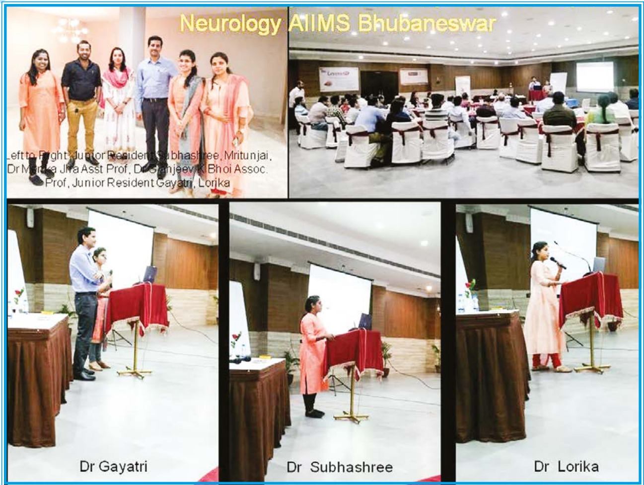
Resident (non-academic) presented cases in monthly twin city Neuroclub meet on 7th April 2018 held at Bhubaneswar