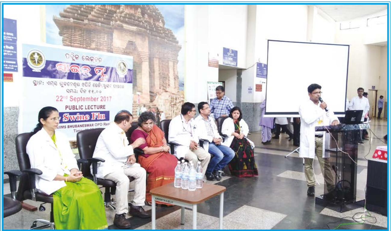
First Public lecture on Swine flu 22 nd sept 2017