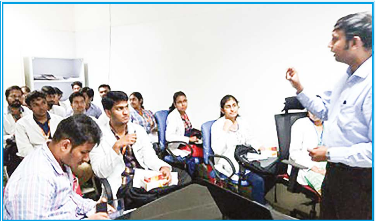
Fig 3: Academic Activities at Dept. of Radiology