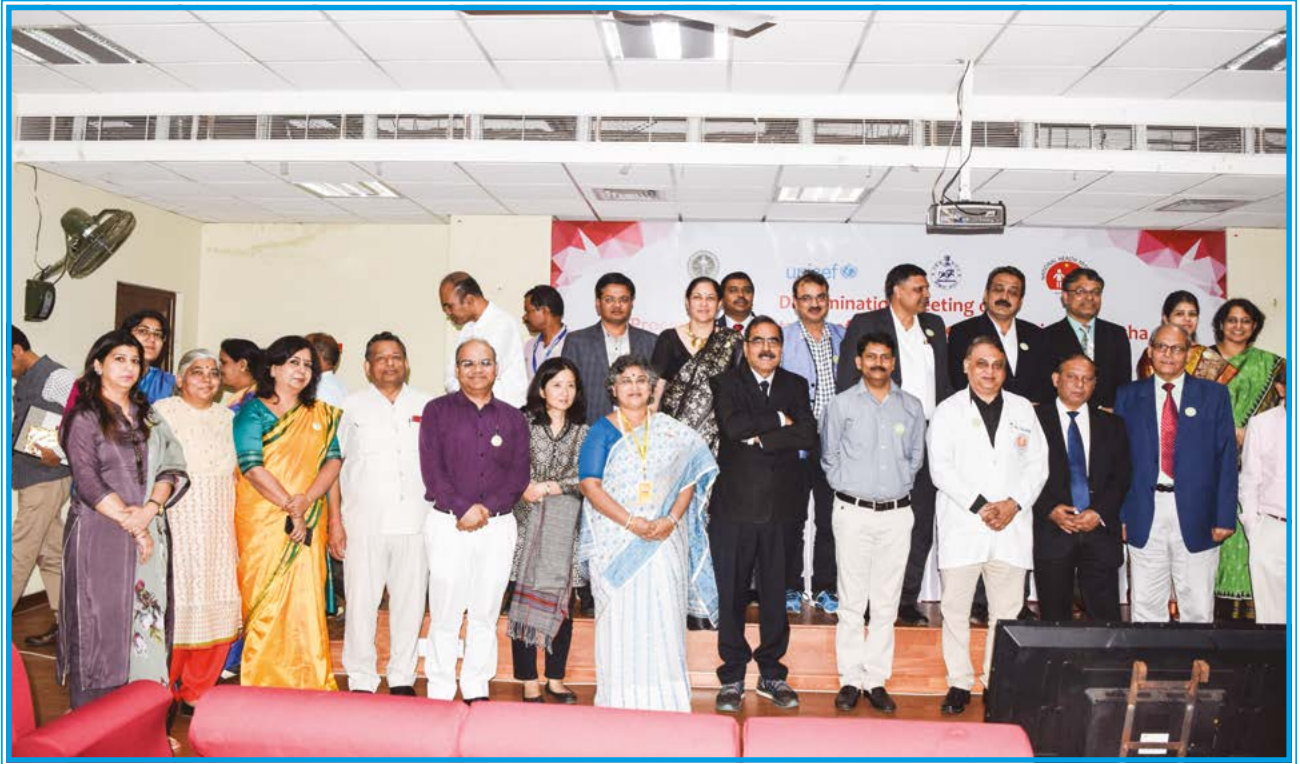
NIPI dissemination meet Worksoop on 21 Nov, 2017 at AIIMS, Bhubaneswar