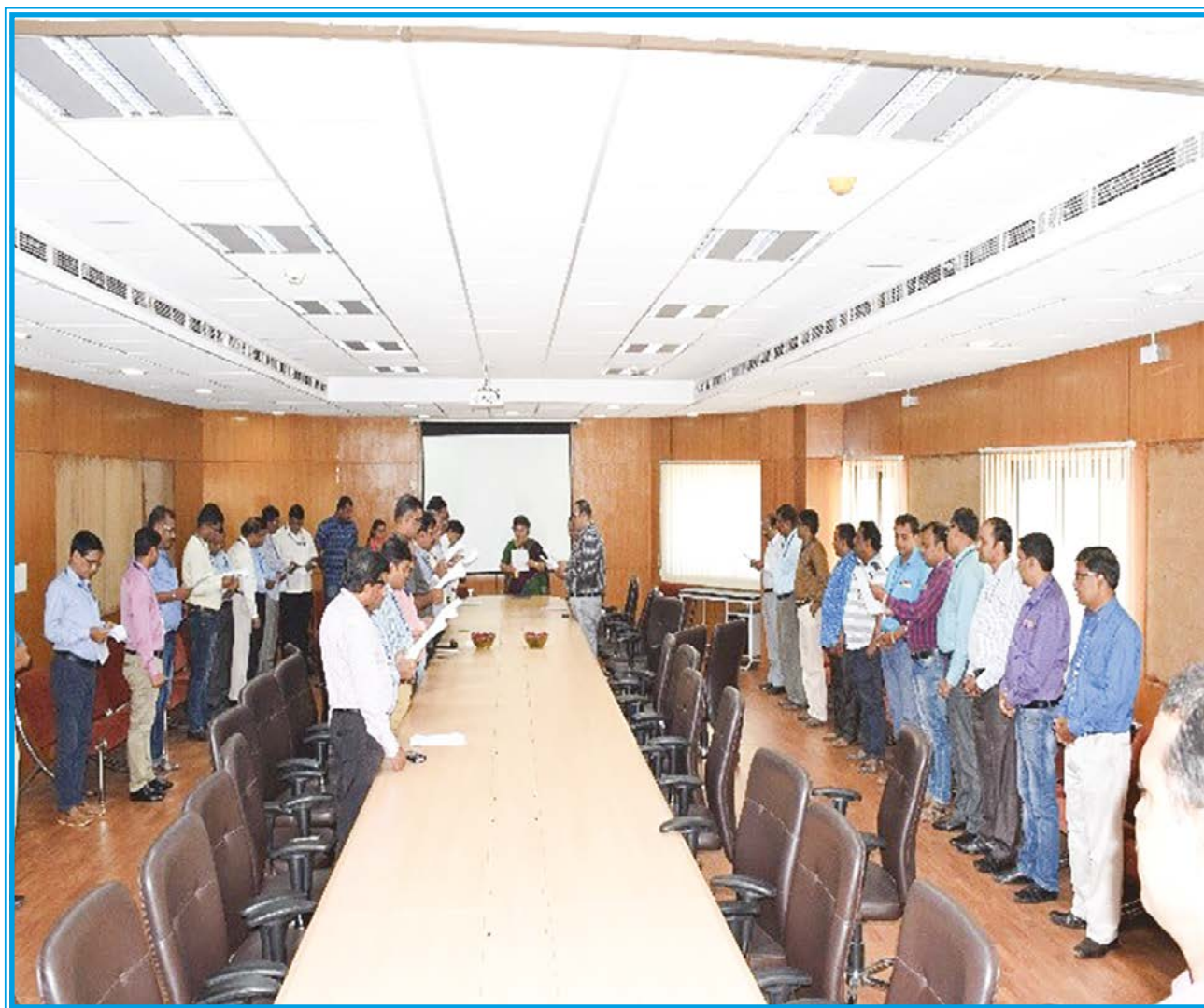
Integrity Pledge by Faculty Members, Staff & Students on 30 th Oct, 2017 at 11.00 A.M.