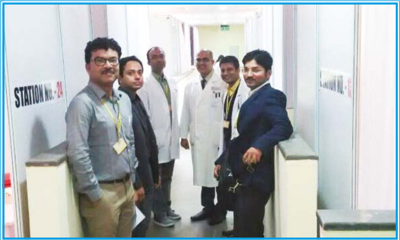
Members of Medical Education Unit conducting OSCE for the first batch of Interns