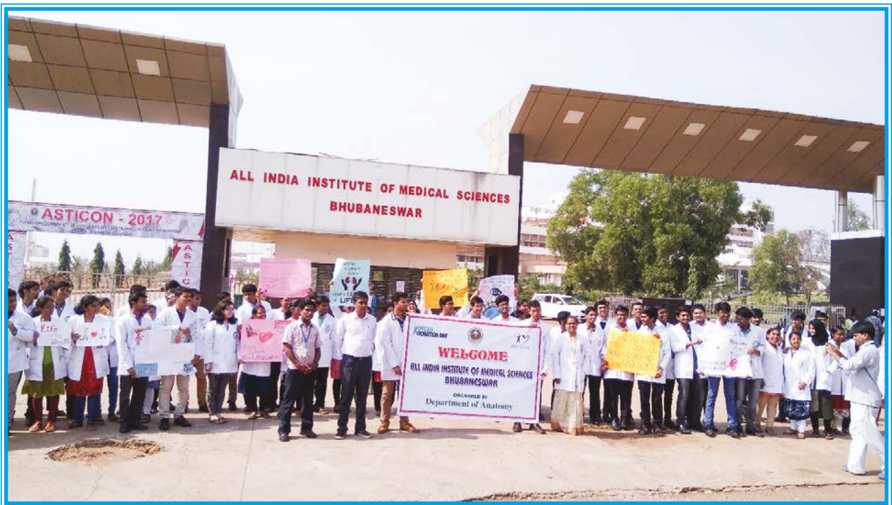
Fig 3: "Organ Donation Awareness " Rally was organised on 25th Nov 2017 by the Dept. of Anatomy and involved the staff and 1st year under graduate students in the campus of AIIMS, Bhubaneswar.