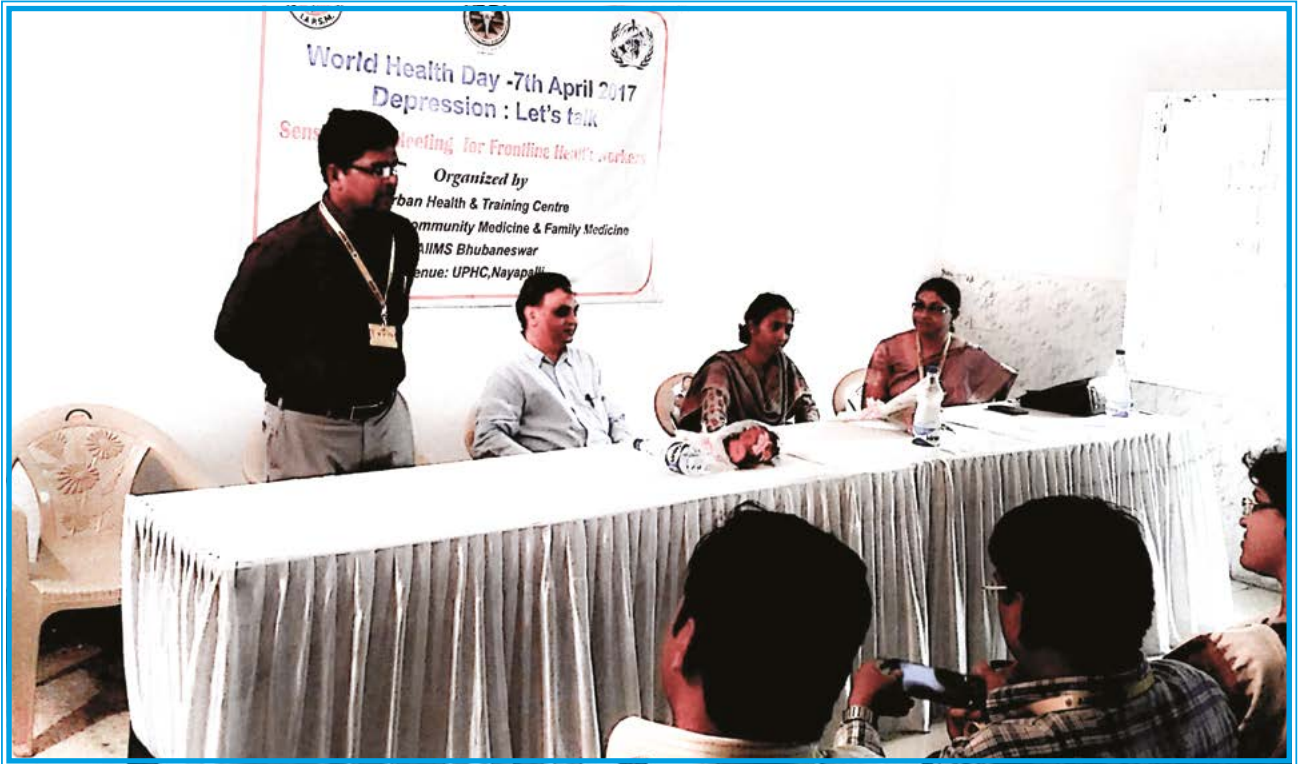
Workshop for grassroots level health worker on World Health Day Theme “Depression – Let’s Talk” on 7 th April 2017 at UHTC Nayapalli