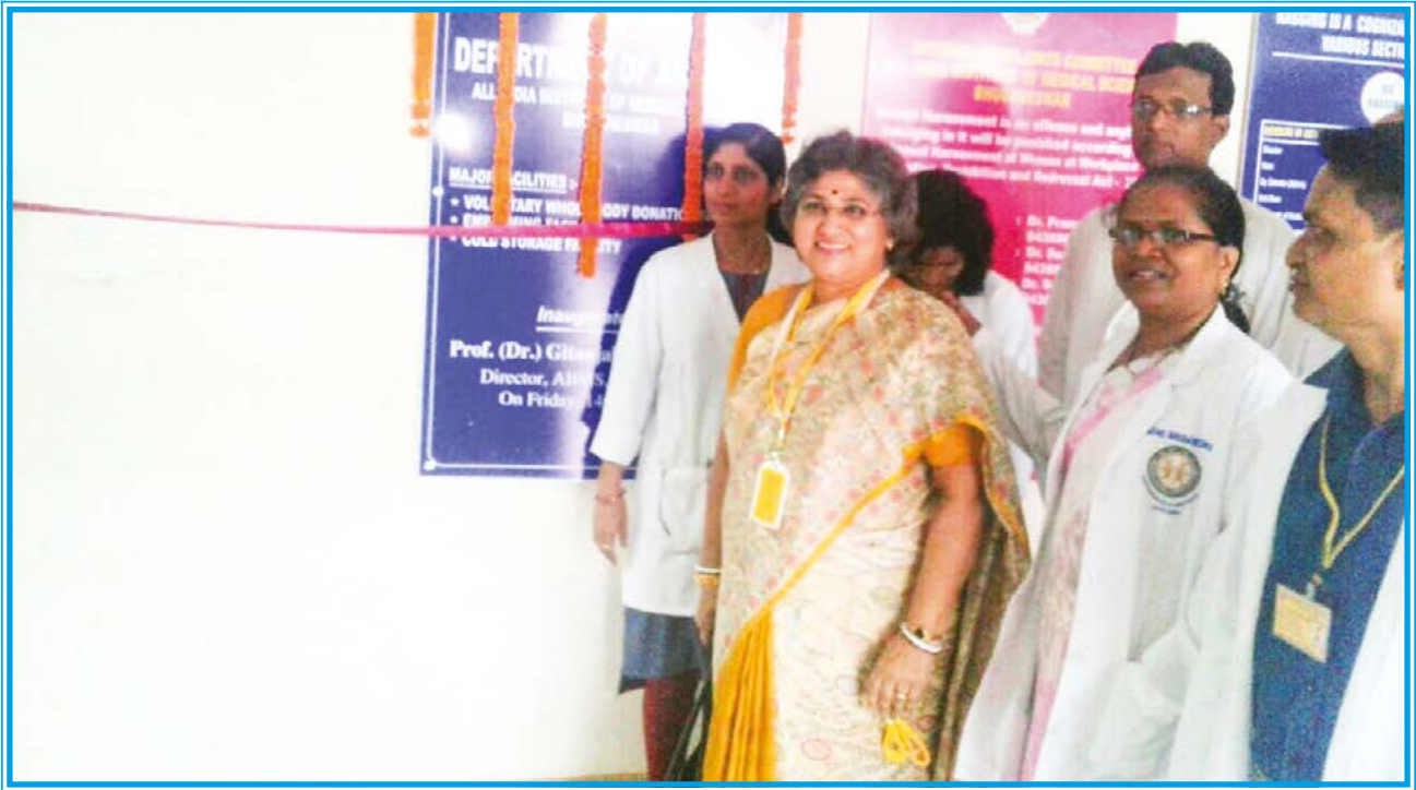
Fig 2: On 14th July 2017, the Director, AIIMS, Bhubaneswar, inaugurated three major facilities of the Dept. of Anatomy: 1. Voluntary Whole Body Donation Facility 2. Embalming Facility 3. Cold Storage Facility