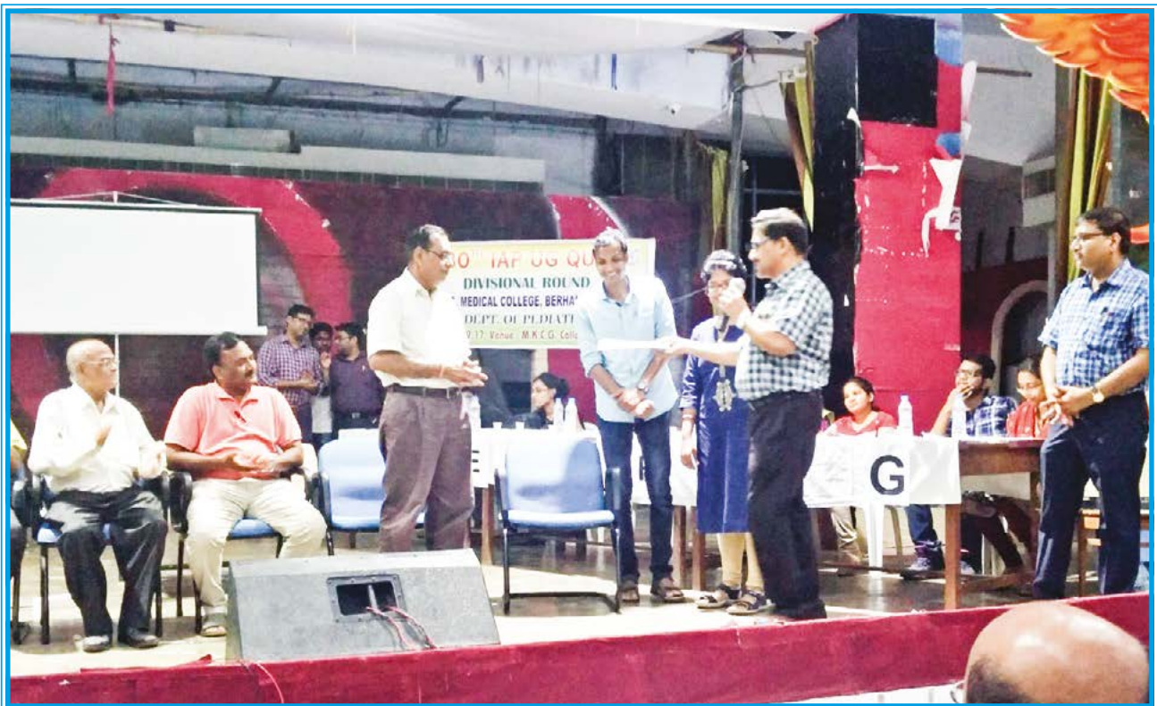
Our MBBS students Winner of IAP UG (Pediatrics) Divisional Round Quiz 2017